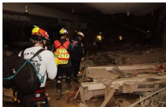
Figure 4-2 This photo was taken inside the mall. The store sign “innovation” is visible on the left. (photo filed 9/19/01) Error! Bookmark not defined.

See below – how were the people able to walk around in there, and not be irradiated or burned or both, so soon after the event? Look at the 2 nd photo – where is the evidence of such high heat? This alone completely negates the validity of this latest variant of the “WTC Nuke” theory.