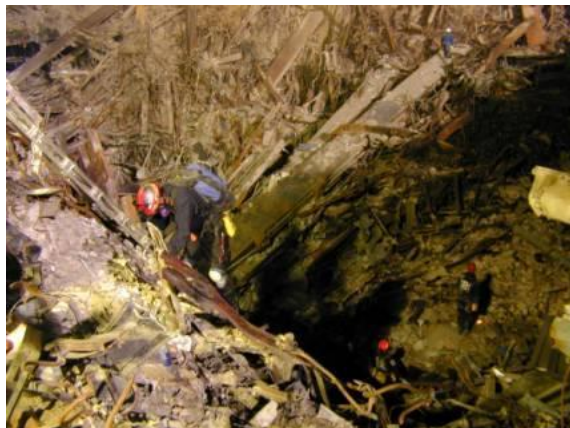
Figure 4-1 - GZ workers descend into the subbasements below WTC2. While there is extensive damage, there is little building debris at the bottom of the hole. There is no sign of molten metal. A worker in the distance walks along a massive core column. (photo filed 9/18/01) Error! Bookmark not defined.

Also, as we can see in the photos below, the basements survived! At no point did they form part of a “nuclear furnace”.