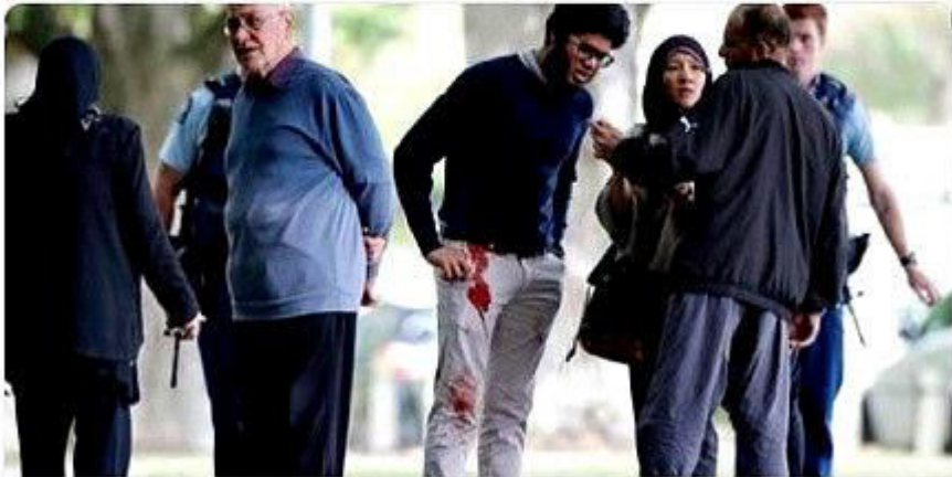
Multiple deaths as gunmen open fire in two mosques in New Zealand's Ch... Police in the New Zealand city of Christchurch said that there are multiple fatalities after shootings in two mosques in the city center on Friday. edition.cnn.com

#NewZealand has all the hallmarks of a classic false flag operation to incite fresh #IS attacks, create chaos and fear, allow the globalists take more control over people and remove freedoms a la 9/11. A professional job. The public are no longer fooled