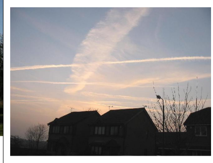
24th Jan 2006, 17-20, Borrowash