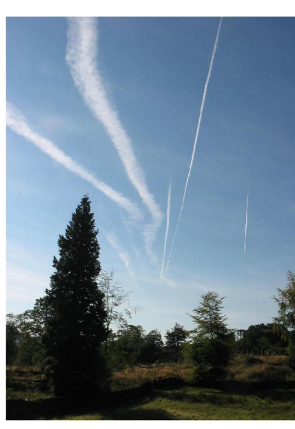
12th Sept 2005, 09-31, Lake District