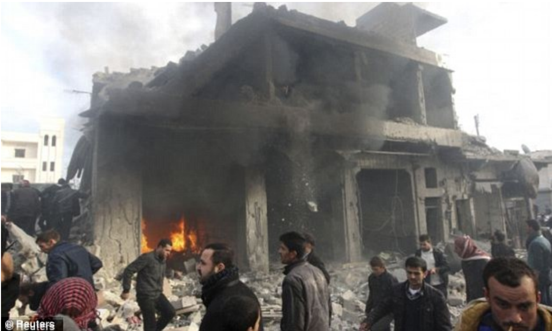
Devastation: People gather at a site hit by what activists said was missiles fired by a Syrian Air Force fighter jet from forces loyal to Assad, at the souk of Azaz, north of Aleppo on January 13

A leaked U.S. government cable revealed that the Syrian army more than likely had used chemical weapons during an attack in the city of Homs in December.