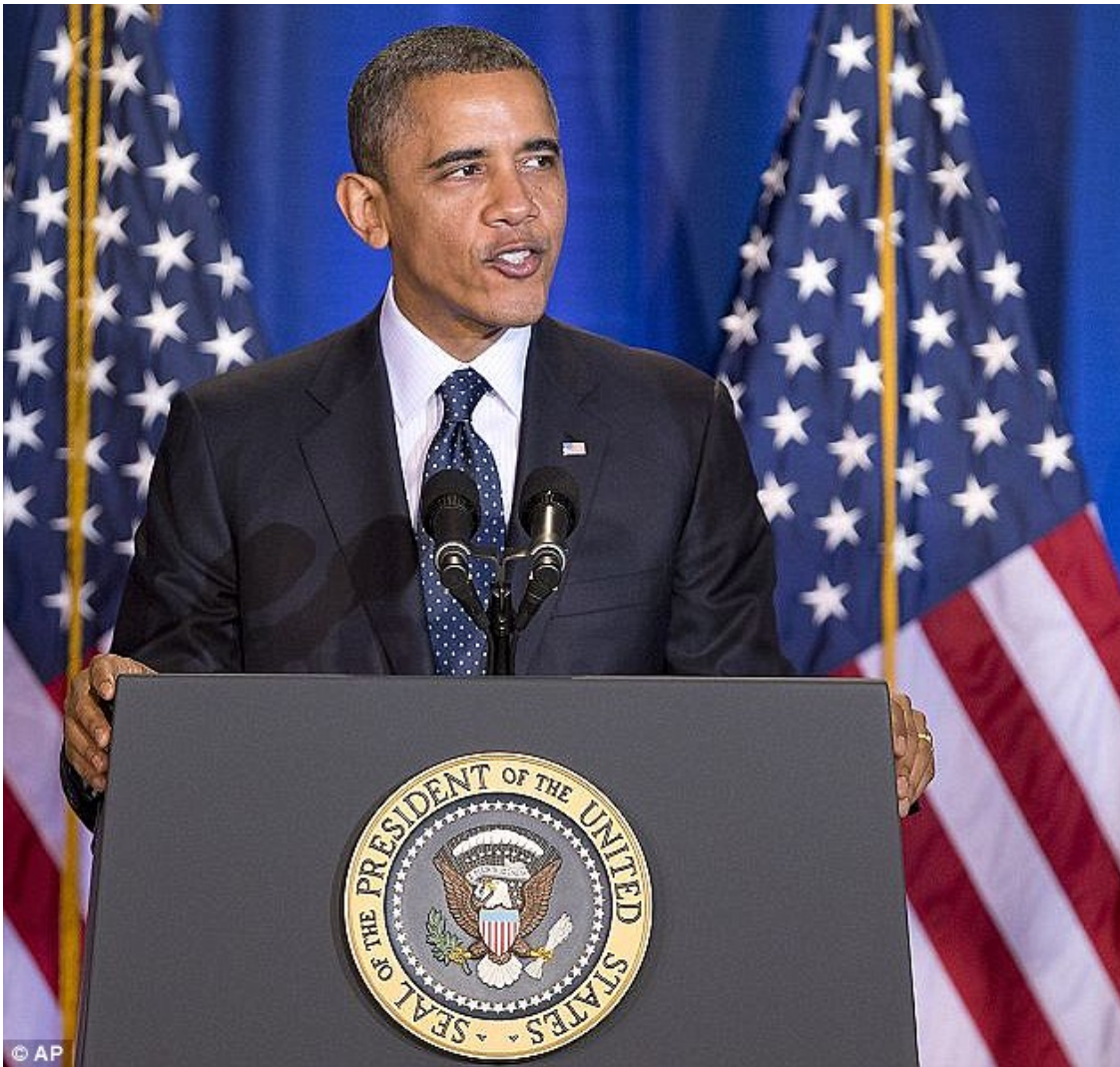
Threats: Barack Obama said during a speech last month that if Syria used chemical weapons against its own people it would be 'totally unacceptable'