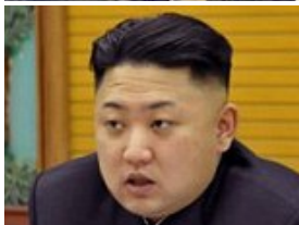
North Korean parents 'eating their own children' after being...