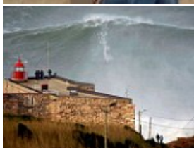
The breathtaking moment thrill-seeking surfer catches...