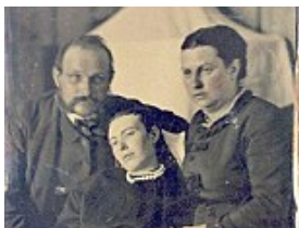
Morbid gallery reveals how Victorians took photos of their...