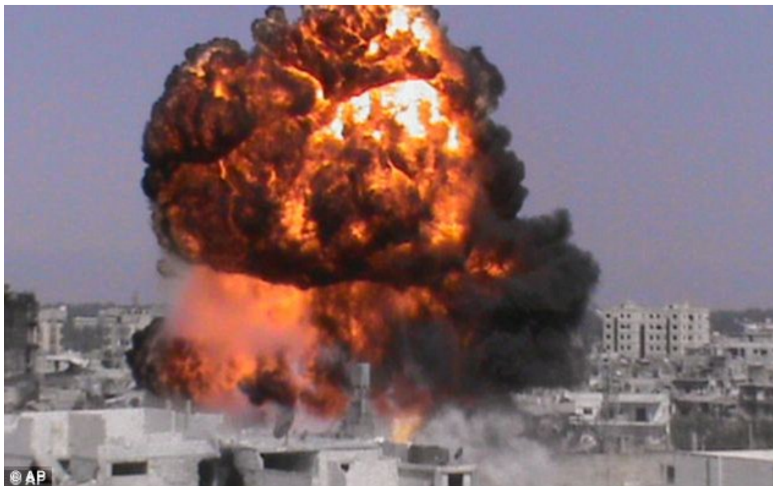
War games: An explosion in the Syrian city of Homs last month. It has been now been suggested that the U.S. backed the use of chemical weapons to spur international military intervention