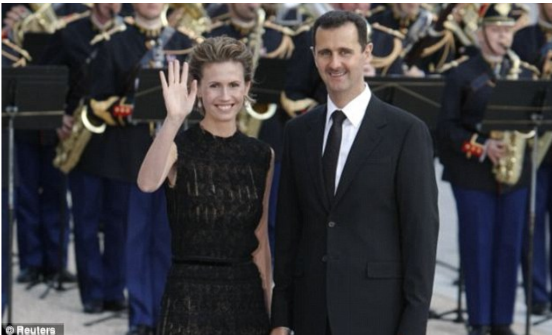
Tyrant: Syrian dictator Bashar al-Assad, pictured with his wife Asma, is facing increasing international pressure over his brutal massacre of his own people

Eye witness accounts from the investigation revealed that a tank launched chemical weapons and caused people exposed to them to suffer nausea, vomiting, abdominal pain, delirium, seizures, and respiratory distress.