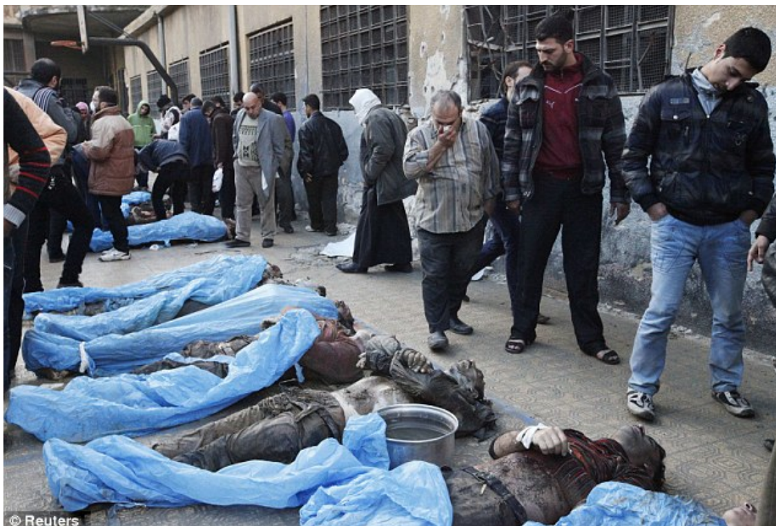
Countless losses: Families attempt to identify the bodies of Syrian fighters shot and dumped in a river in the northern Syrian city of Aleppo today

A spokesman said that the U.S. joined the international community in 'setting common redlines about the consequences of using chemical weapons'.