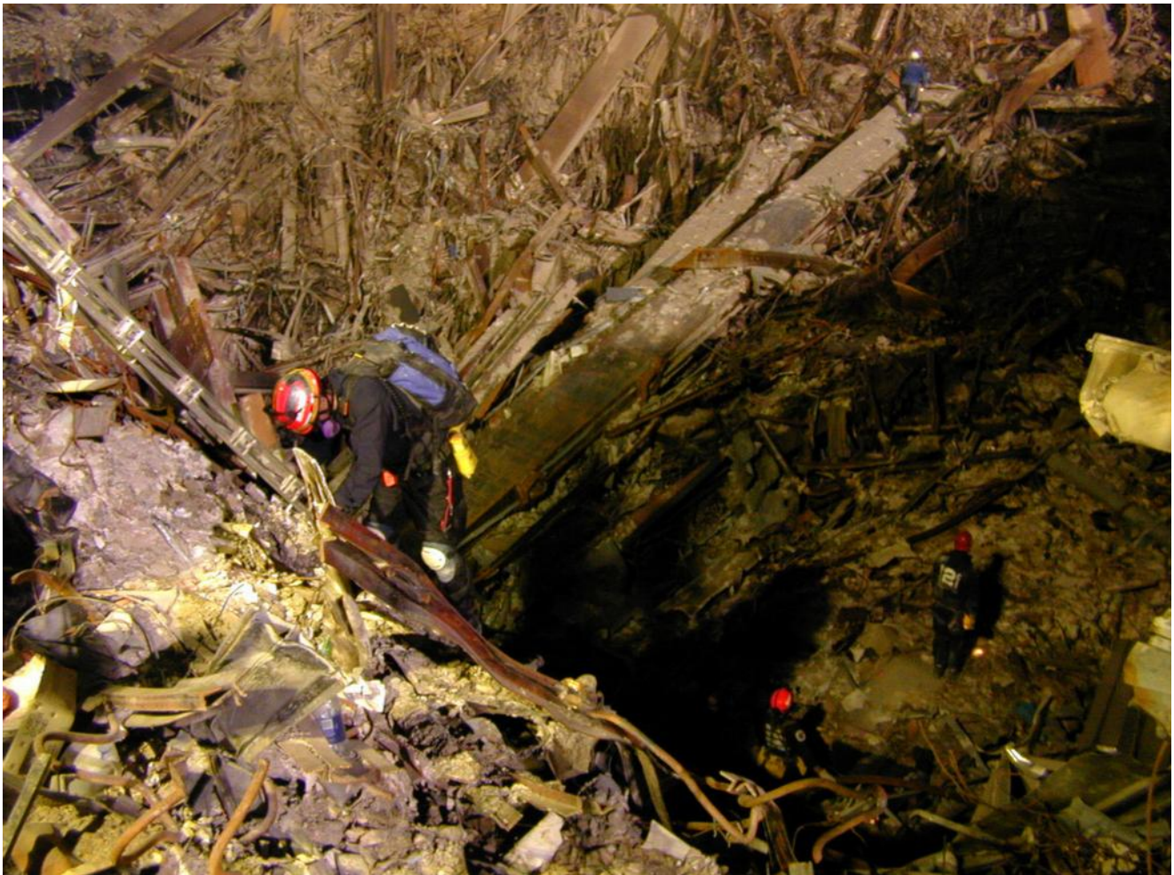
Figure 17. GZ workers descend into the subbasements below WTC2. While there is extensive damage, there is little building debris at the bottom of the hole. There is no sign of molten metal. A worker in the distance walks along a massive core column. There is little to no material in these holes. (photo filed 9/18/01)